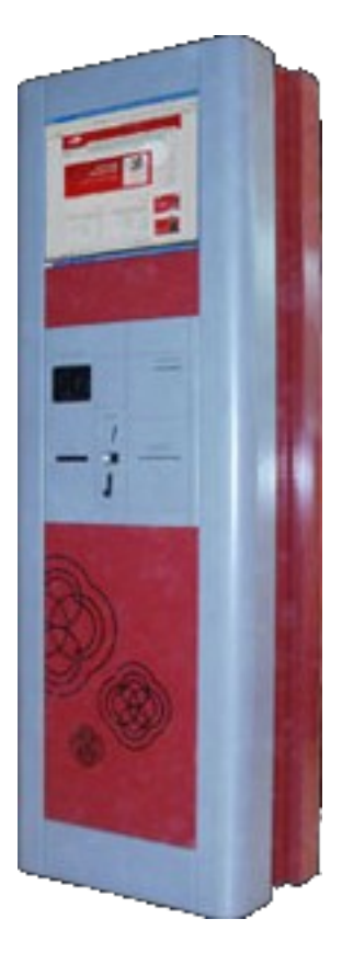
Illustration 2: Some of our popular kiosk chassis designs

applications. In addition, we support locally run applications built using technologies such as .NET, VB, Java, J2EE and GTK. Local SQL databases and web servers provide an unlimited potential for business applications to be deployed on our kiosks.